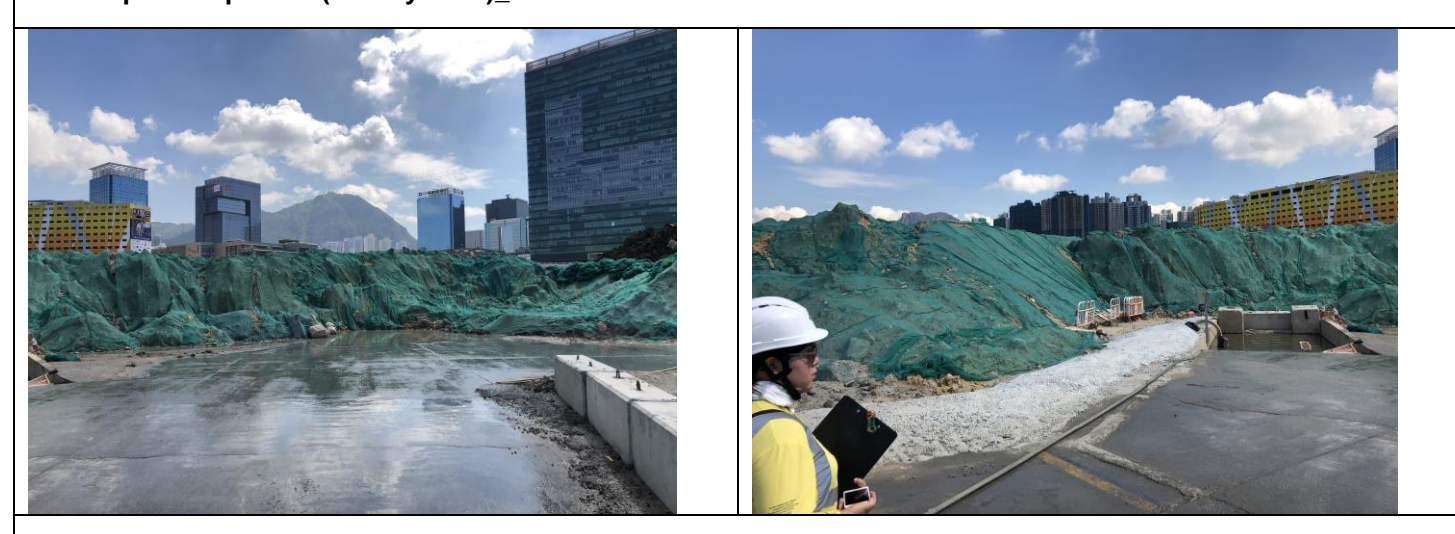
Site inspection photos (7 June 2018)_Portion I