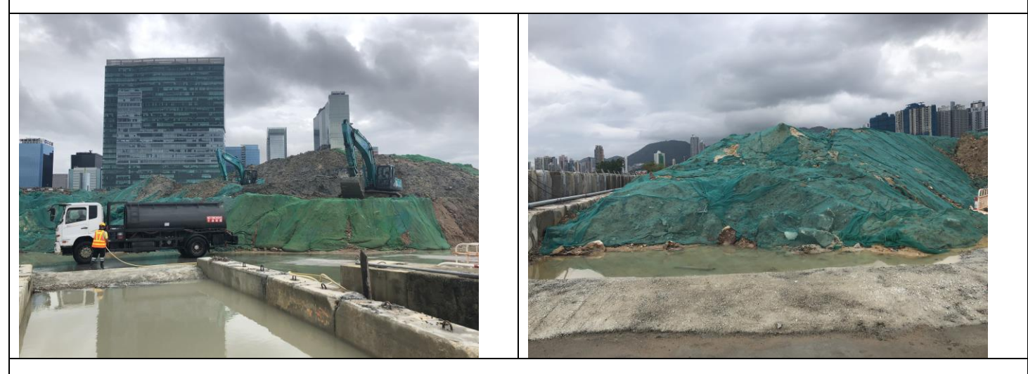
Site inspection photos (14 June 2018)_Portion I